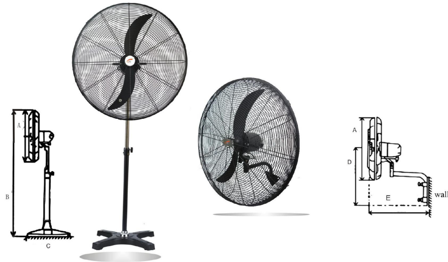
Model No.: FL-500-E(20") FL-600-E(24") FL-650-E(26") FL-750-E(30")